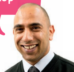
Wasim - Prestwich store

"Even if your area hasn't switched over yet, you can start watching digital TV now. The switchover date is when the old analogue broadcasts stop"