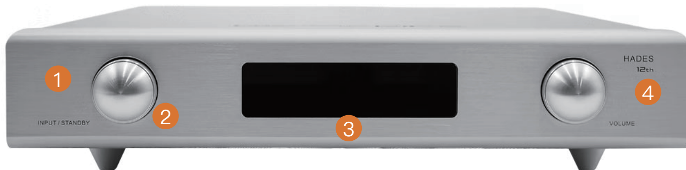
Figure 1. Front Panel