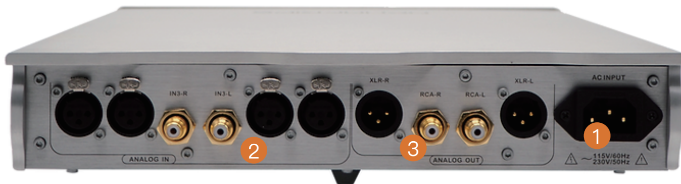
Figure 2. Read Panel